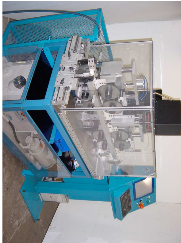
CNC Controlled Hydraulic Clamp Ring Punch

Minland Machine, Inc. 19801 OLD 205 Edwardsburg, Mi. 49112